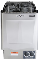
All Custom Cut Saunas