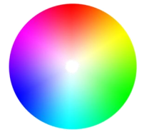
LED Mood Lighting & Separate Control