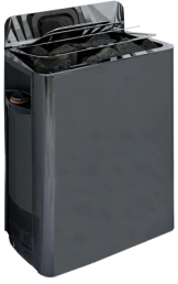
All Outdoor 4 Person Barrel Saunas (Canopy & Traditional)