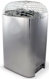
All Indoor Club Saunas