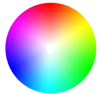
LED Mood Lighting & Separate Control